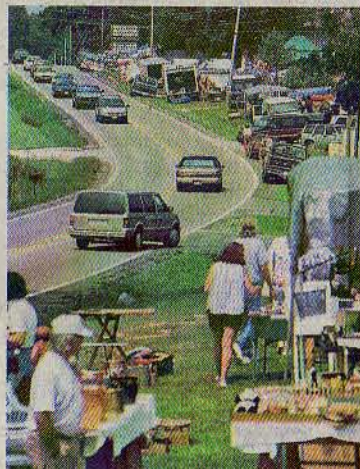
TENN. DEPT. OF TOURIST DEVELOPMENT

From Alabama to Ohio, Highway 127 lures travelers to back roads for junk, antiques and everything in between