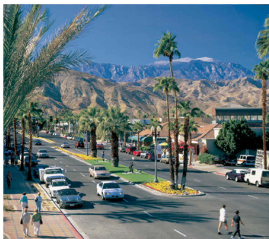
El Paseo shopping, above, and the Pete Dye-designed PGA West TPC Stadium golf course in Palm Springs, below

GO: Don't laugh. This isn't your grandfather's resort town. Yes, Palm Springs still has a little bit of 1950s-era charm. But there are all sorts of 21st-century amenities and reasons to head there this winter, and we're not just talking the Chicago climate (although wanting to escape these temperatures is understandable).